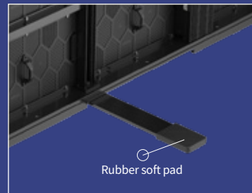
The bottom foot brace is covered with rubber soft pads to prevent injury from sharp objects.