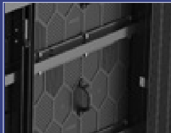
Top rubber pads prevent secondary injuries from the collision.

Rubber pads and a soft mask protect athletes and the LED display, while a special design allows the perimeter screen to slide aside for emergency access.