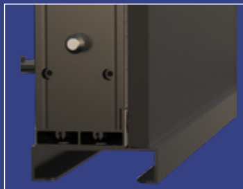
The bottom gap is filled with baffles to prevent foot intrusion.