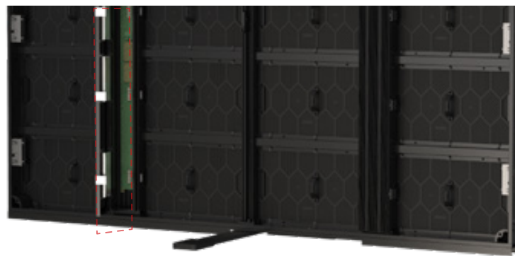
N+1 power backup

N+1 power backup and receiving card dual backup can keep the screen running steadily and efficiently.